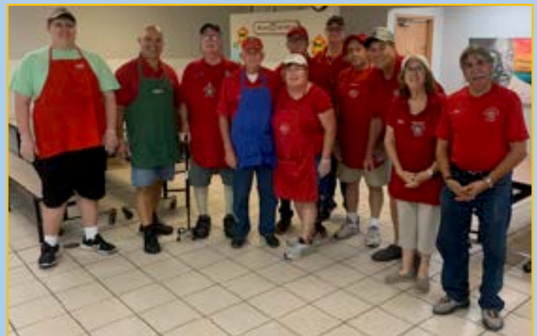
July Daily Bread