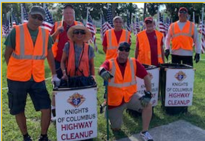
July Highway Cleanup